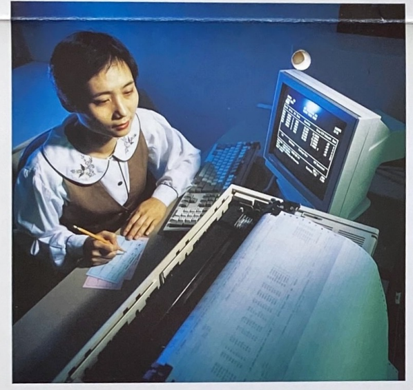
Brokers' manual back-office operations will be automated when CCASS is implemented

After each batch-settlement-run, the required quantity of stocks to be settled will be debited from a selling broker participant's Stock Clearing Account and credited immediately